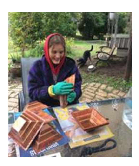
Manufacture of Copper Pyramids and copper implements, chemical free and in Homa atmosphere