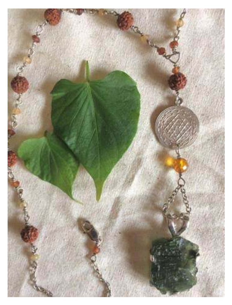
Creating high vibrational, sacred jewellery. Sales support our voluntary Homa Therapy work. If interested to purchase email us for photos of recent creations.