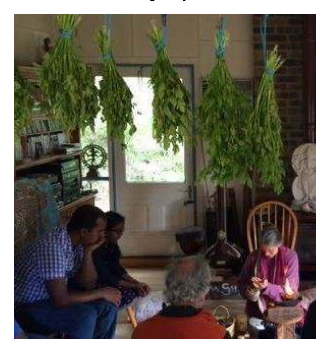
Outreach through Talks, Workshops, Open Days at Om Shree Dham and outstation