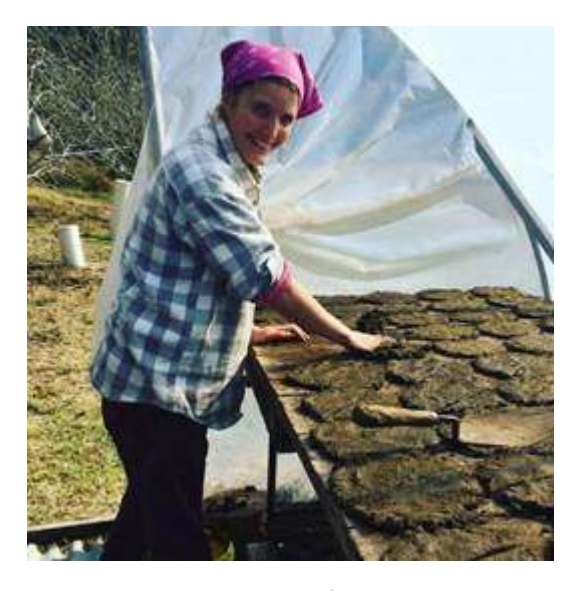
Drying cow dung patties for Homa Therapy practice; mailed out all over Australia