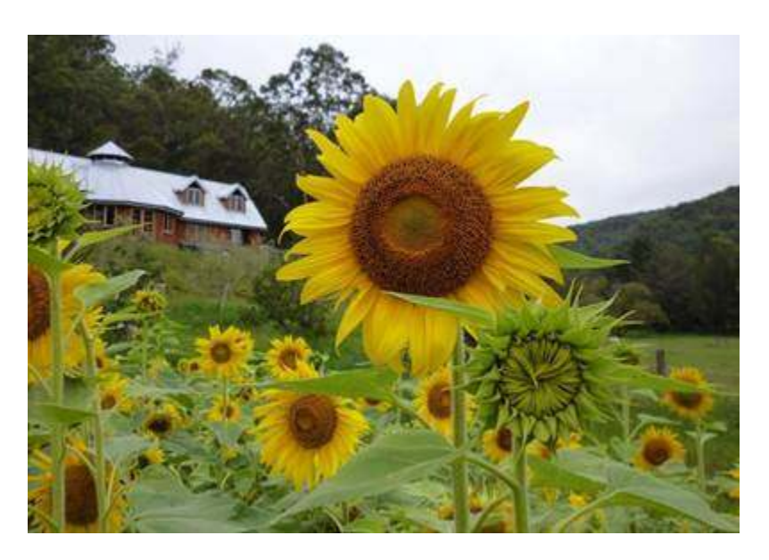
Building a Retreat Centre to run courses on Homa Therapy and other beneficial practices