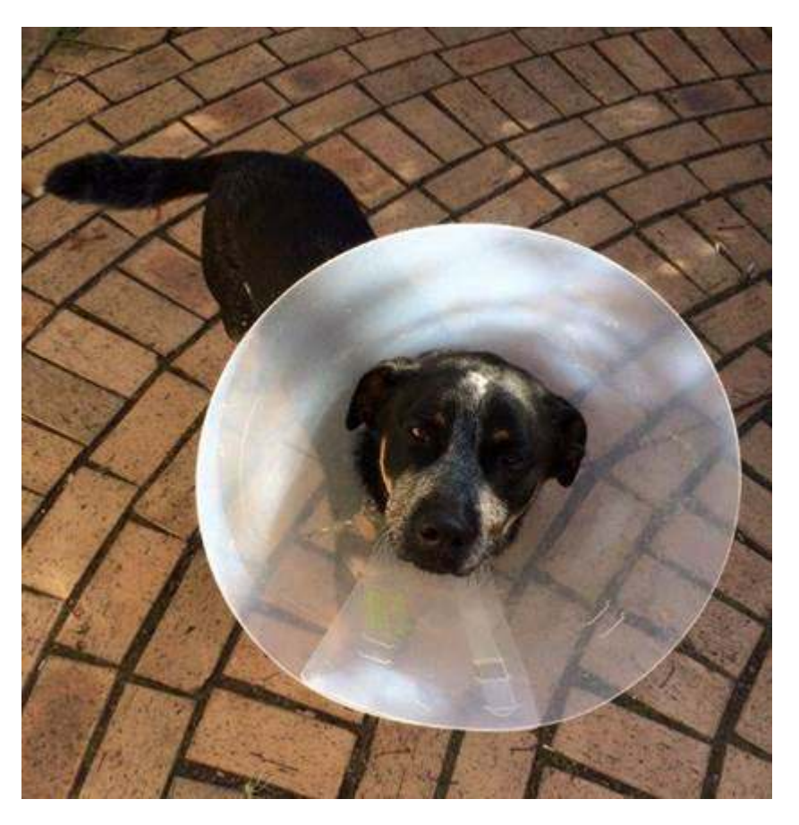
Bolo, our dog with funnel to stop him from biting off his bandages

Below are excerpts from the most recent Homa Health Newsletter from South America detailing equally wonderful healing experiences of body, mind and family dynamics: