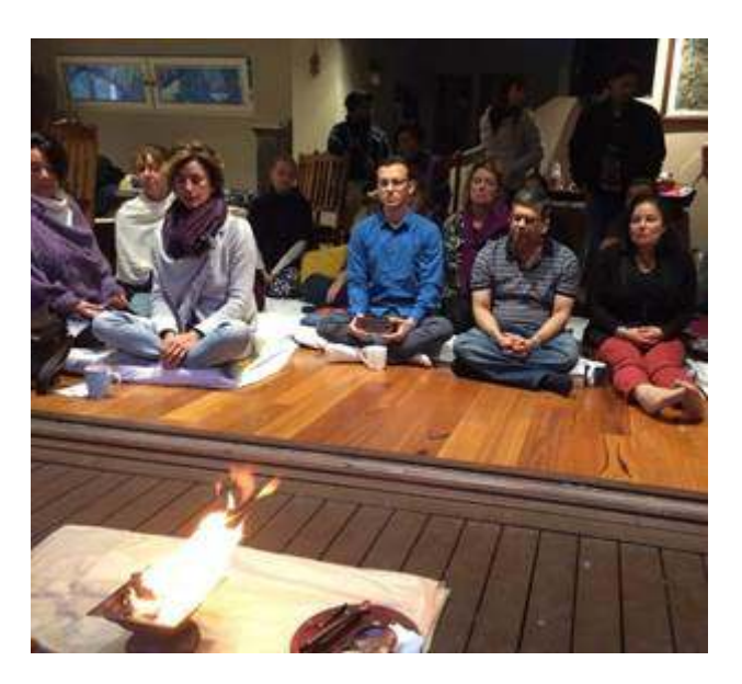
A recent Agnihotra workshop in Sydney

If you live in Melbourne and would like to explore taking up this marvellous simple practice, see attached Flyer for details of Kensington Workshop.