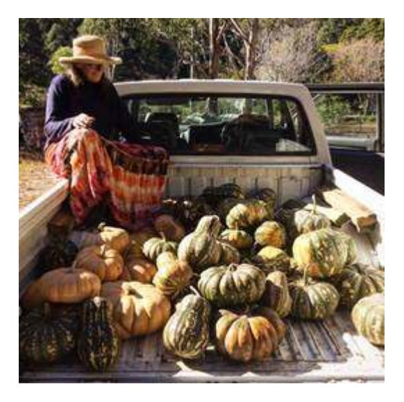
We are also a Homa Organic farm which includes the Homa Resonance System