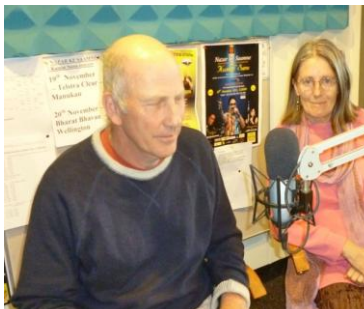
Radio interview Auckland