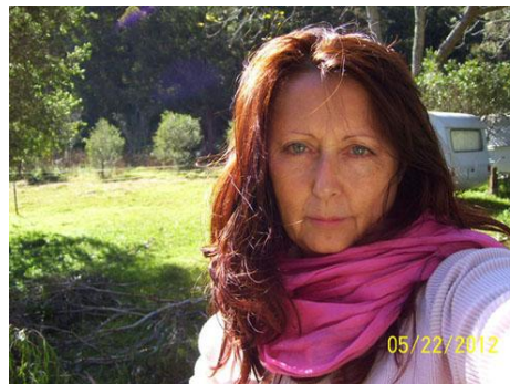
Karuna after 1 day at Om Shree Dham