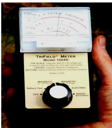
Fig.4 Approx 50 meters away from our Fire hut under power lines, the meter on a higher sensitivity setting is registering low level EMF.