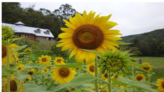
At Homa Therapy Centres, where Homas are performed daily, the life force in the plants, animals and atmosphere is tangible.