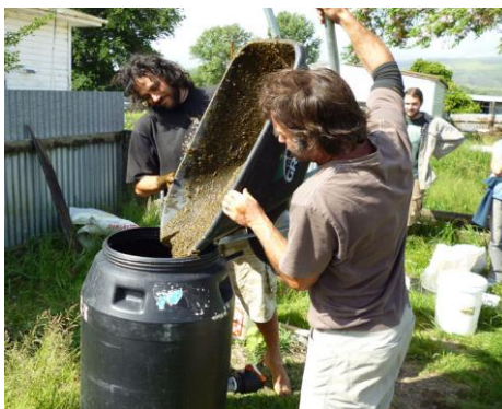
Making Homa Biosol at Koanga Institute and Organic farm

We continue to receive requests for Agnihotra kits from New Zealanders.