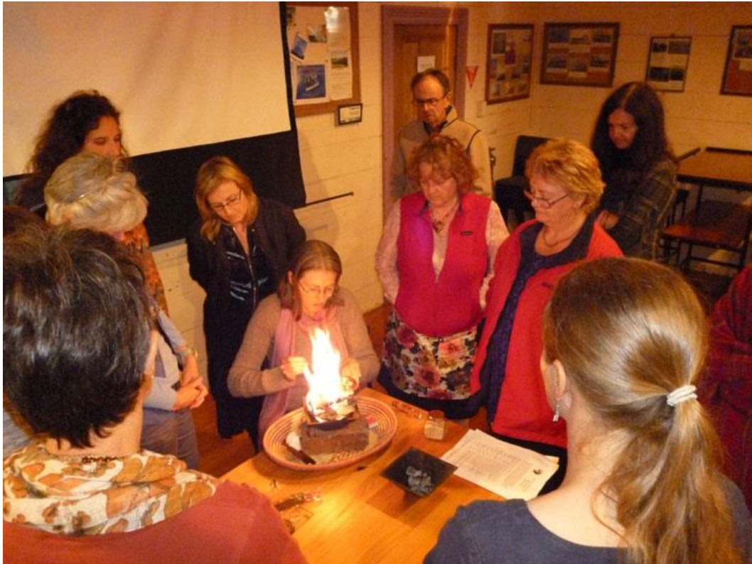
Workshop in small rural community, Awhitu, Nth of Auckland