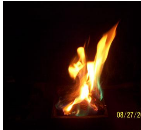
Angel appearing in an Agnihotra Fire performed by Karuna Coleman