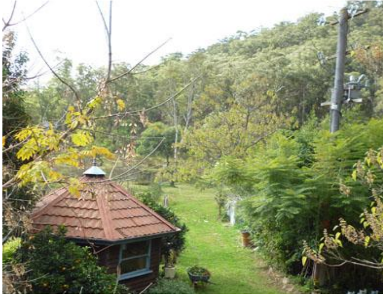
Fire Hut at Om Shree Dham next to power transformer

Over the years we have had many people passing through Om Shree Dham, Homa Therapy Centre here in the Hunter Valley, NSW. Some people who are sensitive to the radiation of high voltage power lines have noted with surprise that our Fire hut is positioned right under an electricity power transformer. However, on going inside the hut all have commented that they do not experience any EMF distortion.