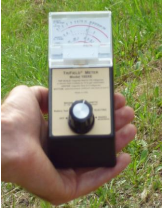
Fig.1 Outside of Om Shree Dham property on the public road under power lines the registers quite high EMF. On low sensitivity setting.

went down. We remembered Shree Vasant telling us that the energy fields of consistent Agnihotris would be healing. When Jake who had not been a regular performer of Agnihotra held the meter under the power line, the dial registered EMF (Fig. 4). We then felt inspired to see what would happen if he drank the ash water. Low and behold the dial moved down close to zero!