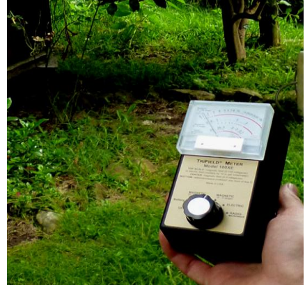
Fig.3 The meter registering zero EMF . Taken next to the Power transformer. Colours have been contrasted to show up dial.