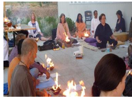
Big crowds- Art of Living