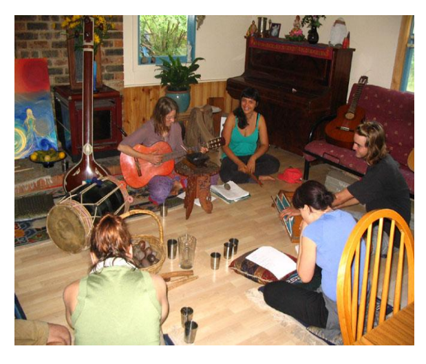
Sunday Satsang at Om Shree Dham with healing Fire and meditation, devotional singing and vegetarian feast.