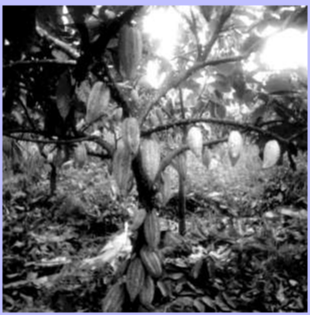
A healthy cacao criolle plant full of fruit, from a farm in Rio Frio, Merida, Venezuela. The photo was taken two months after Homa Therapy work began there.