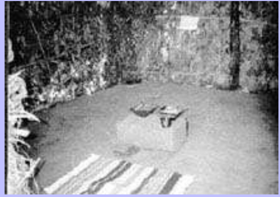
Resonance point on Ghag farm, Chiplun

In December Abhay Paranjpe traveled to the farm of Mr. Ravindra Wadekar near Rajpur, about five hundred kilometers south of Bombay. Abhay established the resonance point using the tenpyramid configuration as shown by the Master Vasant. Six of these pyramids are activated with Mantra. First Purusha Sukta Yajnya is performed in one pyramid. This is then buried in the Agnihotra hut near the eastern wall at a depth of about one-half metre. Then a second pyramid activated with Vyahruti Homa is placed on a column of mud approximately one metre directly above the buried pyramid. Four more pyramids are activated with Vyahruti Homa and are installed on four columns of mud at the perimeter of the farm in each of the four directions. Two pyramids are kept for daily use in the Agnihotra hut next to the mud column and two more are kept in the Yajnya hut where Om Tryambakam Yajnya is practiced daily, one pyramid for Om Tryambakam and the other for Agnihotra if necessary.