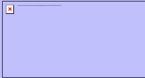
Display at Project Rejuvenation in Venezuela

It is the science of healing and is called the science of resonance. The fire is kept going on all the time and there is a resonance with these twenty-one pyramids. And for hundreds of kilometers the effect goes for healing the plants, giving nutrition to plants, and removing disease. But since creation up till today it has been the fire, the holiest of the holy. Now the time has come that so many scientific things behind this fire will be made public; they are being made public. The ancientmost knowledge known to mankind is from the Vedas. It is given in a language called Sanskrit, which was nobody's mother tongue on this Earth at any time and it is the mother of all European and all Indian languages. If you go to any university in the world where any European language is spoken and you go to the Department of Linguistics and ask them where your language comes from if it is Spanish, Portuguese, Scandinavian, Greek, any European language they will tell you it comes from Sanskrit, via Latin and Greek. So, when we do these Mantras which are given in Sanskrit language, then you should know this is not a foreign tongue. You do not call your grandmother a stranger. Via Latin and Greek it has come to your language.