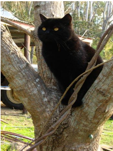
Oliver at Om Shree Dham after the treatment.

Just before Christmas we found our beloved cat Oliver totally paralyzed and near death from 2 large paralysis ticks. The vet told us that at this late stage, when the cat was unable to walk and neither was able to communicate, it was likely to die. We decided to try to help the cat by regularly squirting Agnihotra ash water at hourly intervals down his throat and rubbed ash/ ghee ointment down the length of its spine. It took 3 days for the cat to regain enough strength to be able to walk again and 10 days for complete recovery.