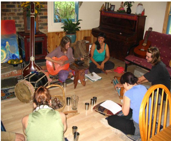
Sunday Satsang at Om Shree Dham with healing Fire and meditation, devotional singing and vegetarian feast.