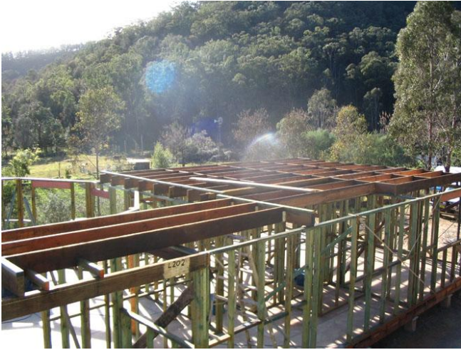
The building so far. See the orbs!