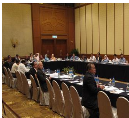
Agri Business Conference K.L. with business CEO's and Govt representatives.