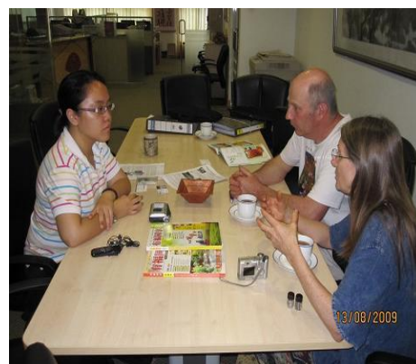
Several newspapers and a magazine called 'Sharing and Caring', interviewed us and published articles on Agnihotra.