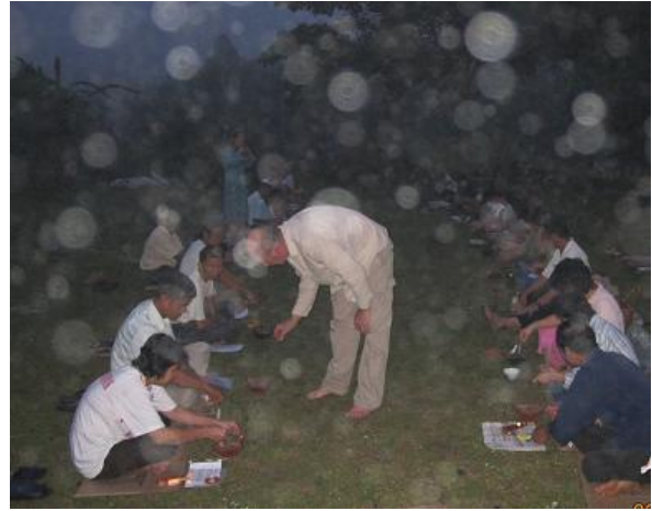
Instruction sunrise Agnihotra at the farming course