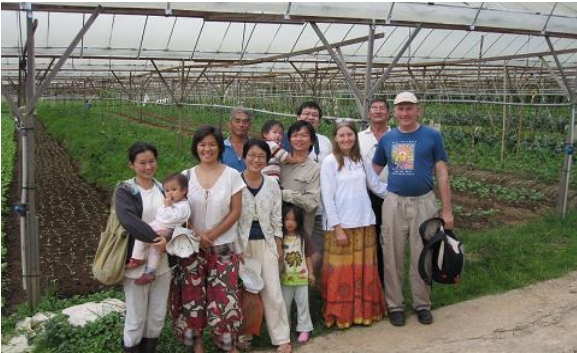
Consulting on the inclusion of Agnihotra at a Cameron Highland's organic vegetable farm.