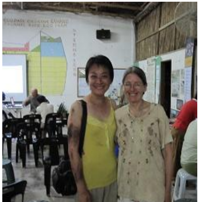
Ash and ghee applied to woman with Auto Immune disease effecting skin