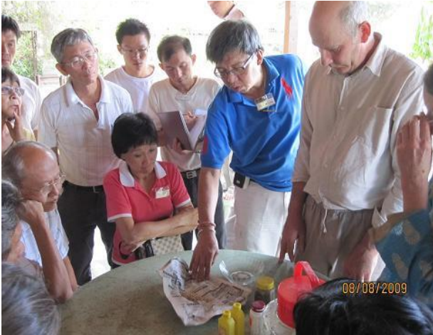
Hands on seed prep with cow urine and ash water..